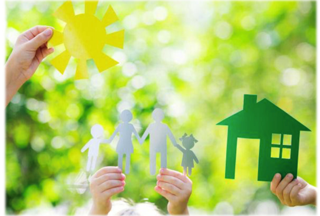
It is exciting to see renovations to homes throughout the neighborhood and to welcome new neighbors!

Look no further than your Hearthstone Manor Newsletter published quarterly for answers to your questions, a recap of current activities in the neighborhood, and information about upcoming neighborhood events.