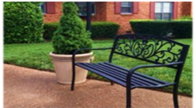
A great place to sit and chat with a neighbor.